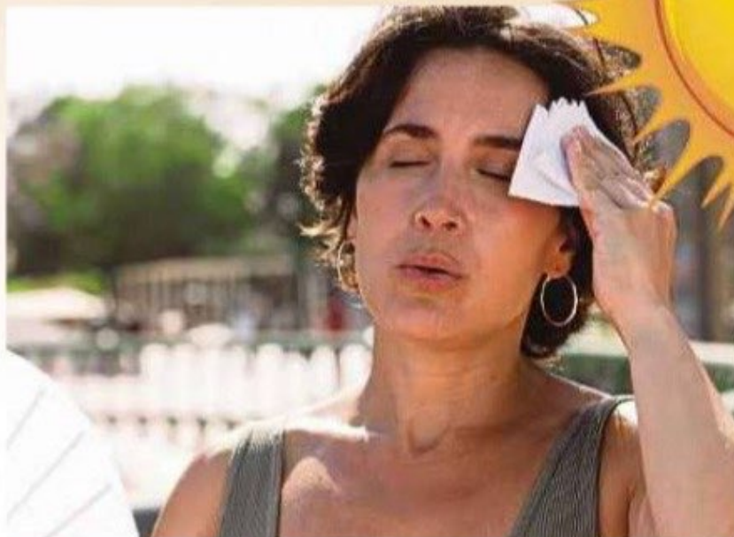
Heat-related health risks include heatstroke, dehydration, kidney dysfunction and neurological disorders.

"Occupational heat stress has become a global societal challenge, which is no