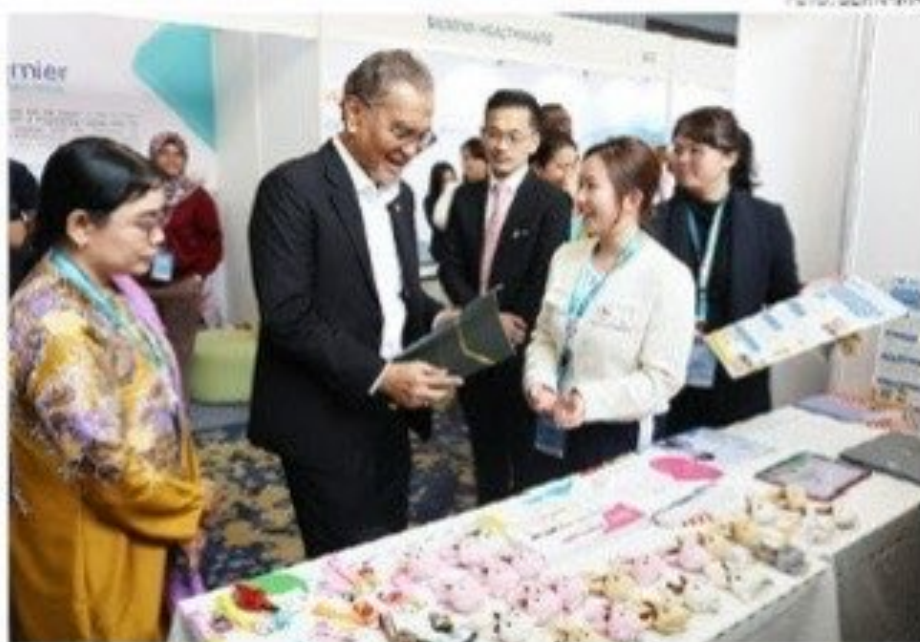
Dr Dzulkefly (tengah) melawat reruai pameran pada majlis perasmian Persidangan Saintifik Kesihatan Bersekutu Kali Ke-4 pada Selasa.

BANGI - Sebanyak 3,850 daripada 4,352 pegawai perubatan Gred UD10 bersetuju menerima tawaran lantikan tetap setakat hari ini, kata Menteri Kesihatan, Datuk Seri Dr Dzulkefly Ahmad.